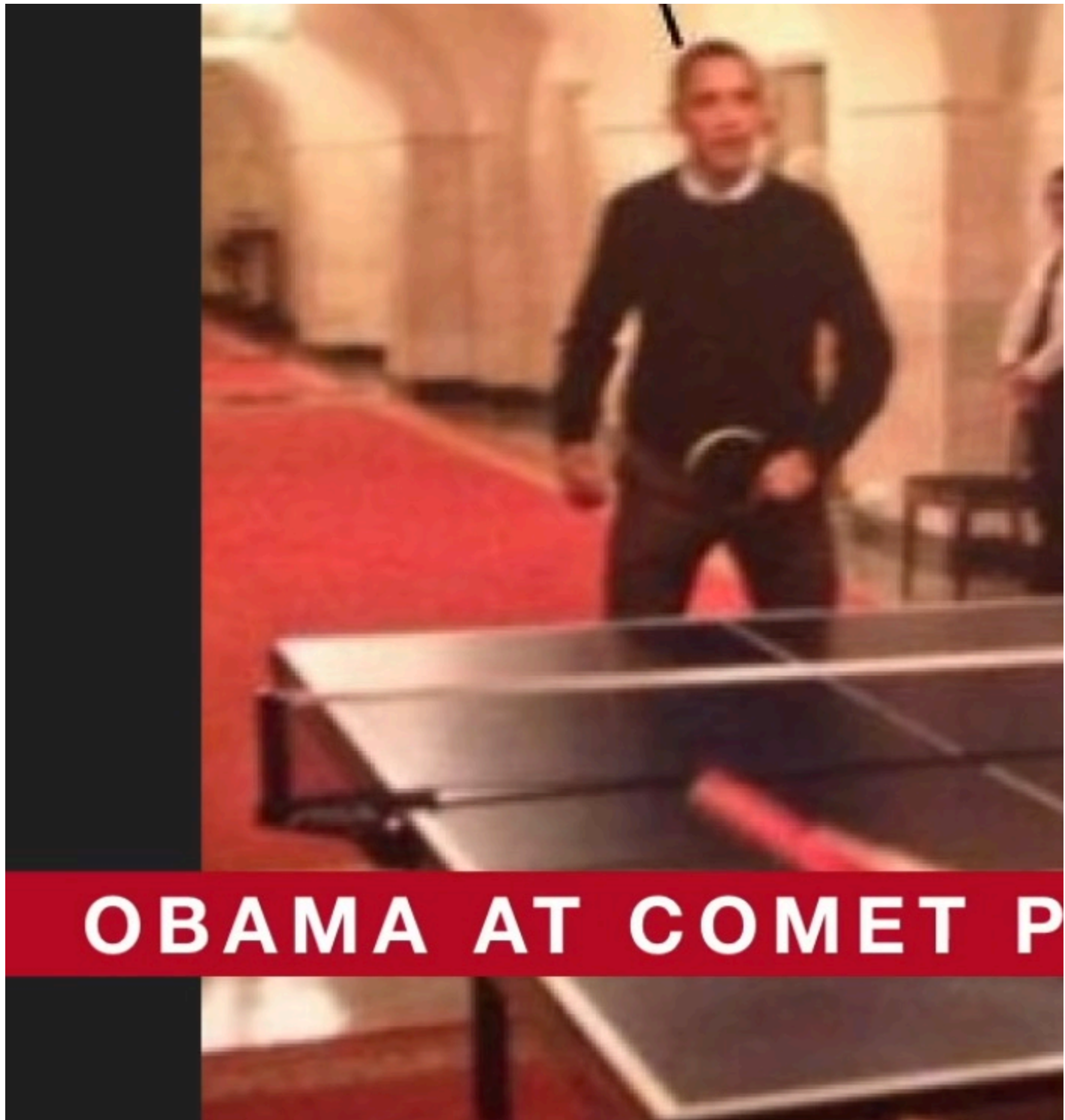
Scene from the “#PizzaGate - What We Know So Far” video YouTube